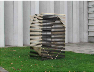
vanité , sculpture, 2012, photographed at ENSANancy (Fr)