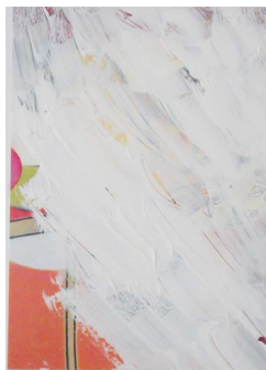
Zsuzsa Klemm, melusine